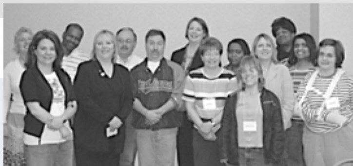
2006 Partners in Policymaking® Graduates

Members of the Partners in Policymaking class of 2006 achieved great results. One member became part of a national advisory board and another, as a result of her independent project, had her idea to reduce physical barriers to building access for people with disabilities accepted by local administrators of a community college.