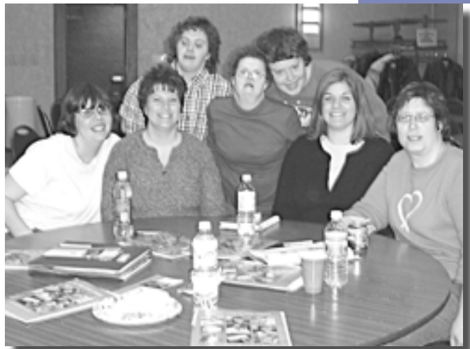
Make the Most of Your Money training session

CMR's advocates worked with parents of school-age children to provide guidance on everything from transitioning to pre-school to creating an individualized education program. In addition, CMR assisted parents by answering questions about the educational system and helped resolve issues that arose throughout the year.